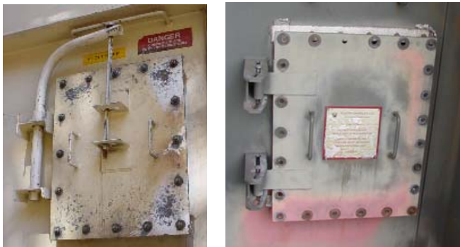
Hard to open bolted doors with hot spots

Proper doors can be opened and closed quickly by one person.