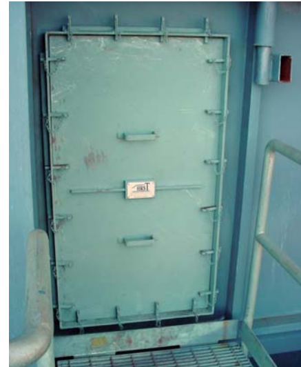
Retrofit HRST Access Door

Open and close quickly with just a hammer!